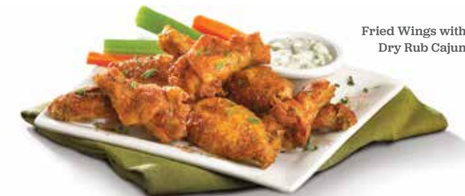
Fried Wings with Dry Rub Cajun

Additional nutrition information available upon request.